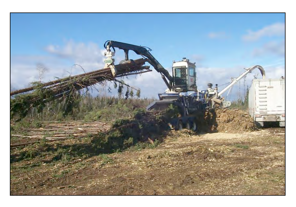
Figure 6 Roadside chipping