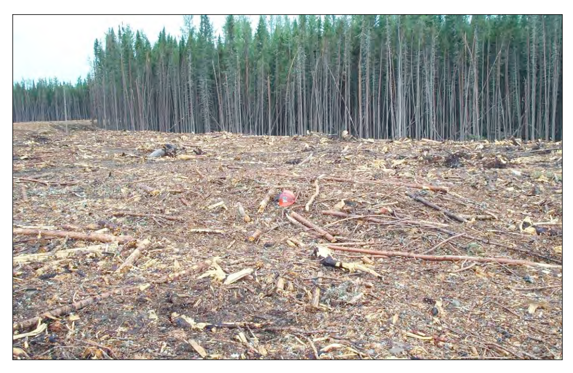
Figure 3 Excessive slash loading.

When assisted regeneration is prescribed and there is a concern that excessive slash loading would obstruct silvicultural activities like site preparation and planting.