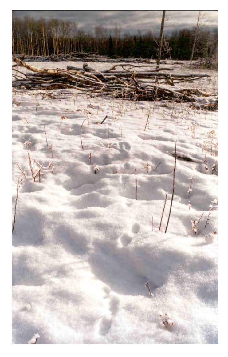
Figure 8 Signs of wildlife using debris piles

IRMTs may allow or require more or less coarse woody debris remain on site and the creation/retention of coarse woody debris piles in cutblock areas with significant marten (and other small mammal) populations in order to retain habitat and help maintain their numbers. Literature review recommends that piles should be one to two metres in height, three to five metres in width and five to ten metres in length. The piles should be located about 30 to 75 metres from edges (cutblock, riparian or residual patches of trees) and distributed at a density of one pile for every five hectares. These piles would consist of logging slash, including a mixture of tops, limbs and larger logs.