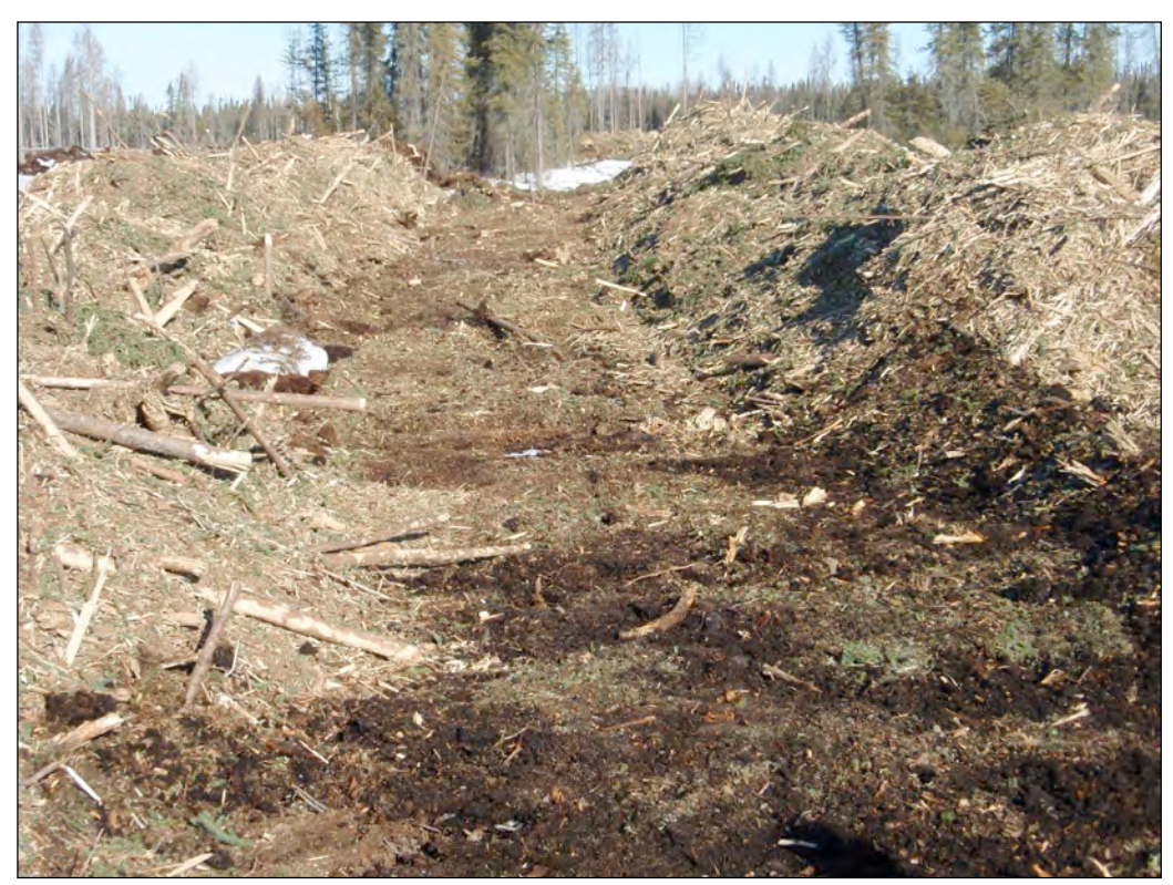
Figure 4 Chipper wood debris windrows.