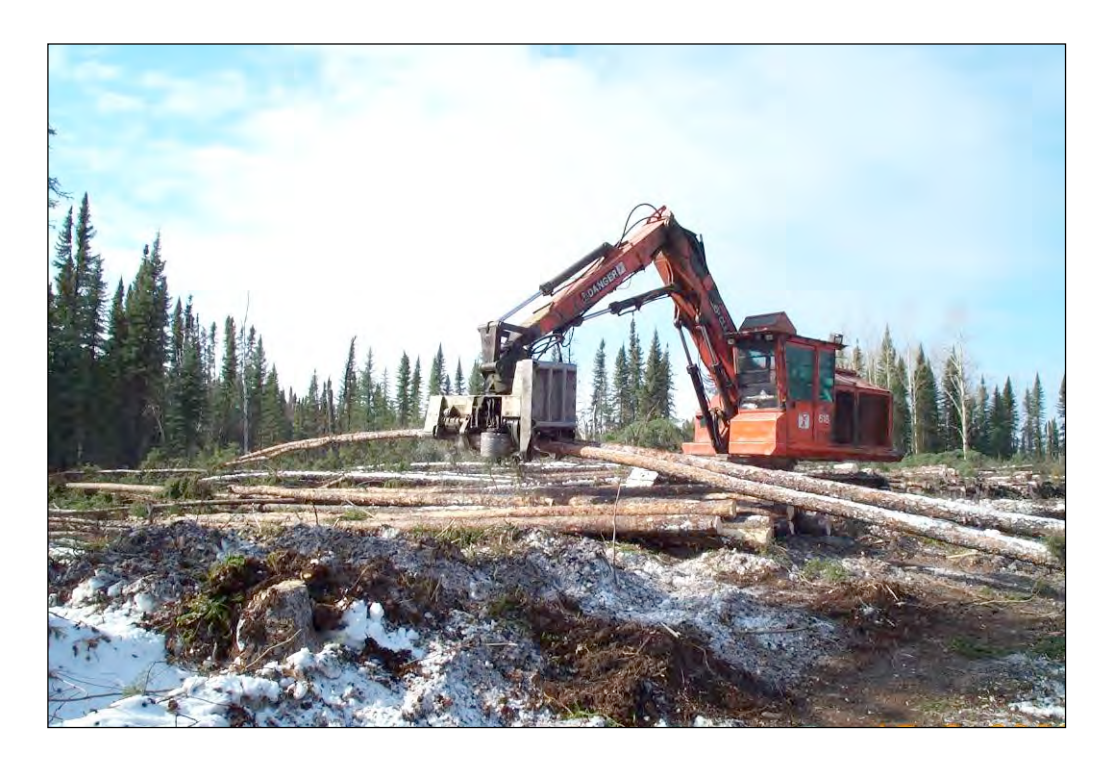
Figure 7 Roadside limbing