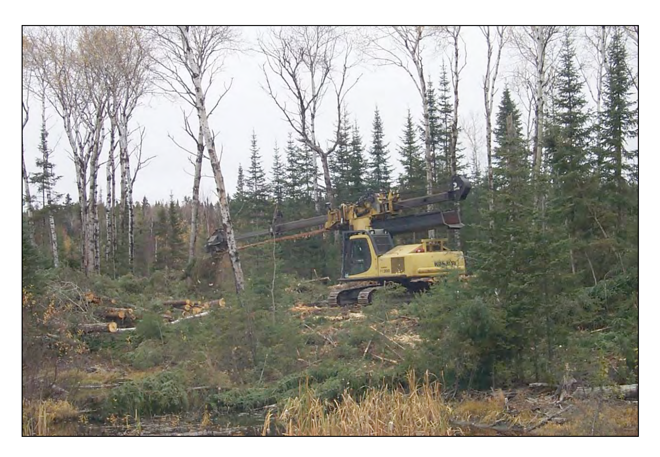
Figure 1 In-block limbing