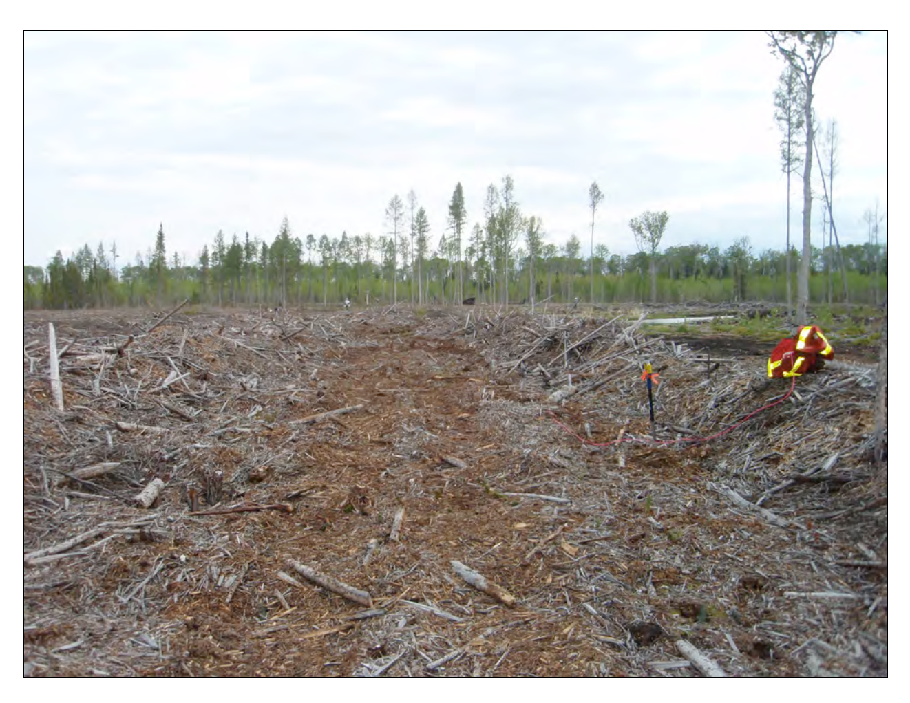
Figure 5 Trees planted in chipper wood debris windrows.