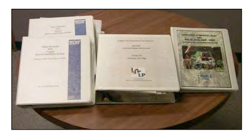
Figure 10 Examples of FML Operating Plans