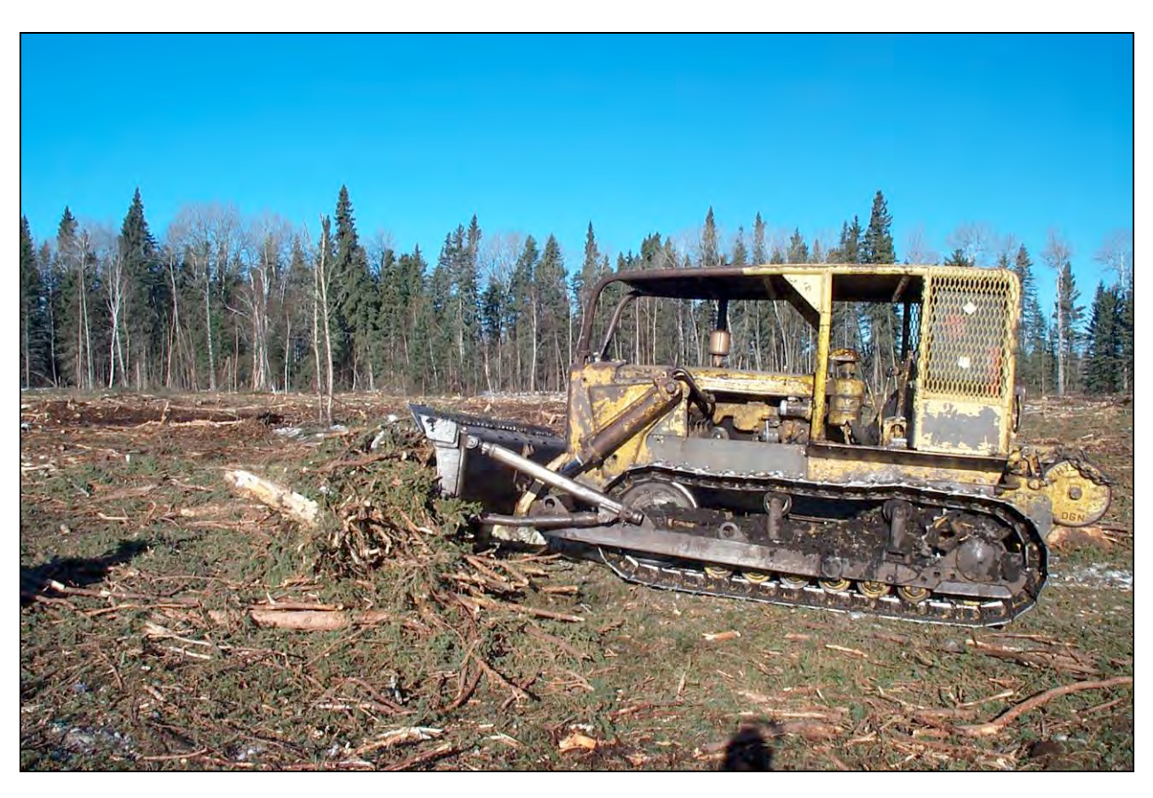
Figure 2 Slash piling

In general a combination of biomass utilization, spreading some material on tertiary roads and landings and burning some of the remaining accumulations is preferred over burning all piles at roadside. Biomass spread on tertiary roads and landings assists in vegetating the site by keeping trucks and all terrain vehicles off the compressed soils.