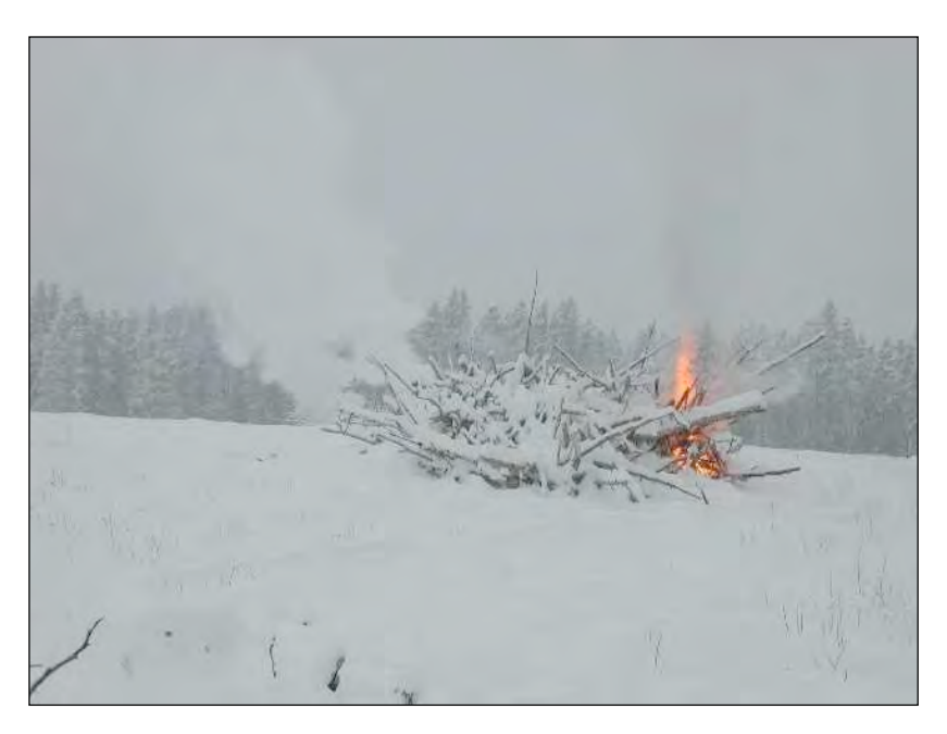
Figure 9 Debris pile burning