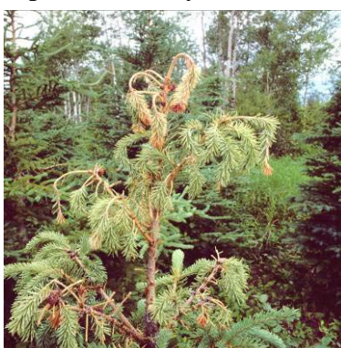
Figure 7: White pine weevil exit shepherd's crook

regenerating white pine. It is also an important pest of young spruce plantations in western Canada. It predominantly attacks trees between the ages of five to 35 years.