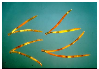
Figure 19: Pine needle cast banding

There are many native pine needle casts and some introduced. Lophodermium pinastri , Lophodermella concolor and Cyclaneusma minus are pine needle casts that have caused noticeable damage on occasion in Manitoba. Field identification of the species of needle cast is difficult.