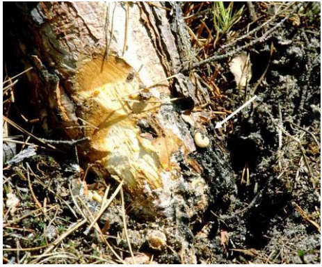
Figure 14: Resinosis and larva - pine root collar weevil