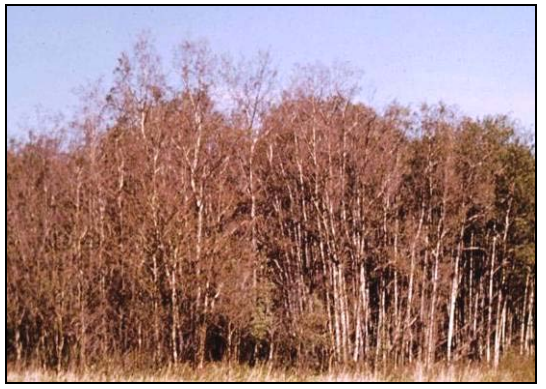
Figure 16: Forest tent caterpillar defoliation