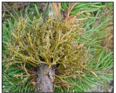
Figure 27: Dwarf mistletoe aerial shoots on pine