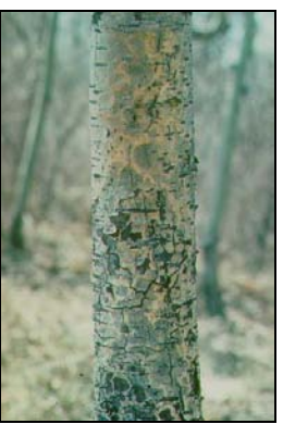
Figure 64: Hypoxylon canker conidial blisters