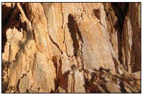
Figure 30: White pocket rot in stump

White (red) pocket rot: This type of decay occurs in pines and spruces. It accounts for approximately one-half of the decay found in pines and white spruce and one-third of the decay found in black spruce. It is primarily a trunk rot ( Phellinus pini ) of white and jack pine but is more common as a root and butt rot ( Inonotus tomentosus ) of red pine and white spruce. This decay appears as lens-shaped cavities parallel to the grain. These cavities are sometimes empty, but are most often filled with a white fibrous mass of almost pure cellulose, surrounded by firm light red to reddish-brown wood (Figures 30 and 31). Black, irregular-shaped zone lines are occasionally present in the decayed wood.