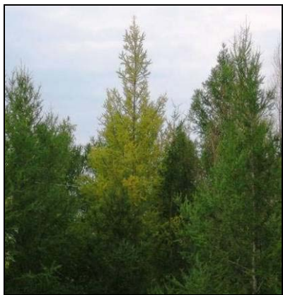
Figure 13: Larch declining due to eastern larch beetle

The eastern larch beetle, Dendroctonus simplex occurs throughout the range of tamarack, which includes northeastern United States, much of Canada and into Alaska. In Manitoba, localized outbreaks have occurred in the past. However, an outbreak which commenced in 2001 has expanded throughout much of tamarack's range within southeastern Manitoba and the boreal plain forest. Three successive winters with above normal temperatures, resulting in increased larval and pupal survival, combined with excessive precipitation increasing tree stress, are contributing factors to this widespread outbreak.