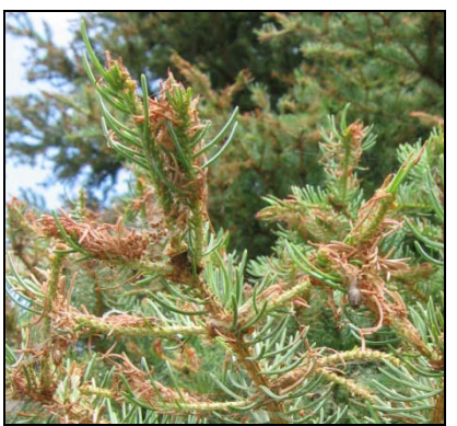
Figure 1: Larval frass and clipped needles webbed to partially consumed shoots

Eastern spruce budworm, Choristoneura fumiferana , is the most destructive and widely distributed forest defoliator in North America ranging from Newfoundland to Alaska. The destructive phase of this pest is the larval or caterpillar stage. In Manitoba, the budworm feeds on white spruce, balsam fir and to a lesser extent black spruce.