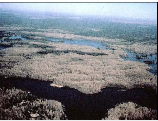
Figure 17: Forest tent caterpillar – aerial view of widespread severe defoliation