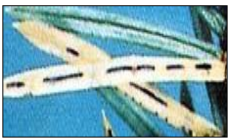
Figure 21: Lirula needle cast fruiting bodies

Lirula, Stigmina and Rhizosphaera needle casts are common on spruce in Manitoba. The fruiting bodies produced on the needles are used for species diagnosis.