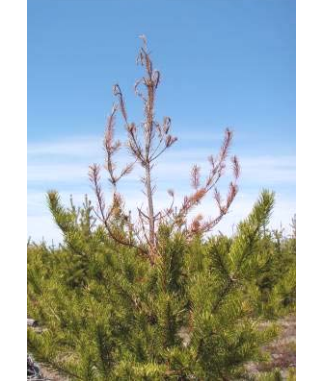
Figure 8: Late season white pine weevil symptom