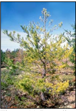
Figure 55: Root disease chlorosis

Armillaria spp. are complex fungi which can act as an aggressive killer of healthy trees, a secondary pathogen of stressed trees and as a beneficial saprophyte decaying dead plant material. Its role as a secondary pathogen is generally in over mature trees or in those stressed by other insects and disease or environmental conditions. Armillaria often acts as a primary pathogen on young reforested sites due to the large amount of inoculum present on the decaying root systems of the previous stand.