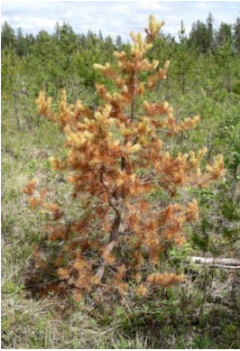
Figure 15: Advanced symptoms in jack pine