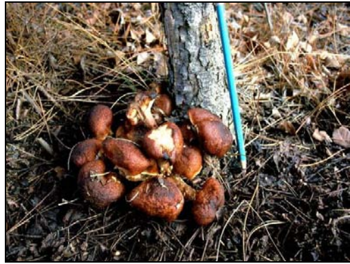
Figure 58: Root disease fruiting body