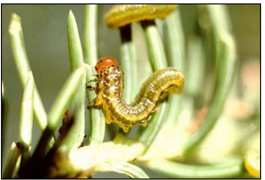
Figure 5: Yellowheaded spruce sawfly larva

The yellowheaded spruce sawfly, Pikonema alaskensis , is native to North America. It ranges from coast to coast in Canada and into the Northwest Territories. Its hosts include all native and exotic species of spruce. In Manitoba it attacks white and black spruce and the introduced Colorado blue spruce.