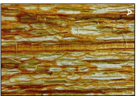
Figure 31: Close up of white pocket rot

Red heart rot: This type of decay is found in balsam fir. It accounts for over two-thirds of the advanced rot in this species. It is primarily a trunk rot, which in cross-section frequently occupies all or most of the heartwood. This decay is a medium to deep reddish-brown colour. It tends to remain in an intermediate stage between incipient and advanced decay for a relatively long period of time. In its later stages, it becomes stringy and crumbly in texture and tends to fade slightly in colour.