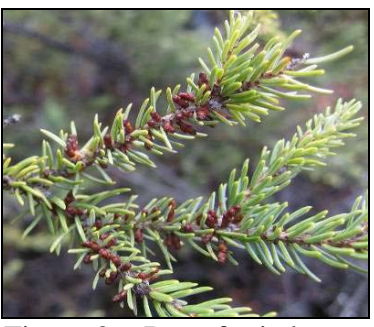
Figure 26: Dwarf mistletoe aerial shoots on spruce

A dwarf mistletoe loss simulator model was developed for Manitoba Conservation and Water Stewardship by F.A. Baker of Utah State University. This model can be used for both species mistletoe. The model is used at the stand level to predict losses due to dwarf mistletoe over time and to help in making the best management decision for the stand given the predicted losses.