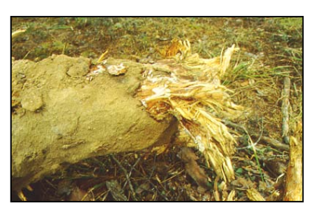
Figure 53: Yellow stringy butt rot

Brown cubical rot: This decay type occurs in all of the conifers. It is more common in red pine and white spruce than other conifers. For the most part, it is confined to the butt in all species. In the early stages softened wood is yellowish to light yellow-brown. It soon becomes dark brown and is separated into small, irregular, roughly cubical blocks (Figure 54) that are easily crushed to a powder between the fingers.