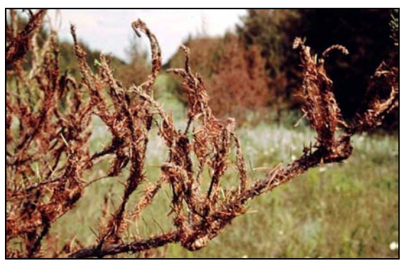
Figure 3: Partially consumed needles clipped and webbed to shoot with frass and a pupal case

Jack pine budworm, Choristoneura pinus pinus (Freeman) is a major pest of pines in the Great Lake States of Michigan, Wisconsin and Minnesota, central and northwestern Ontario, Manitoba, and Saskatchewan. Severe outbreaks seriously affect the growth and quality of vast areas of pine. Jack pine is the favoured host, but red pine, Scots pine, lodgepole and occasionally white pine can be seriously defoliated when growing near susceptible jack pine.