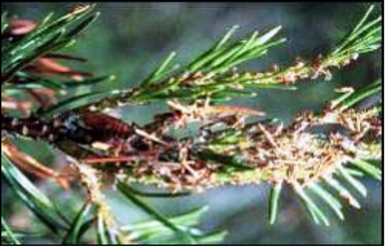
Figure 4: Severe jack pine budworm defoliation – scorched appearance