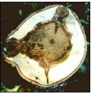
Figure 62: White trunk rot - advanced decay