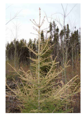
Figure 6: Yellowheaded spruce sawfly severe feeding damage