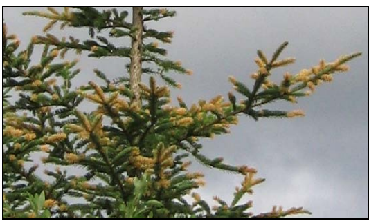
Figure 23: Spruce needle rust symptoms on spruce

Chrysomyxa ledi and C. ledicola are common spruce needle rusts in Manitoba.