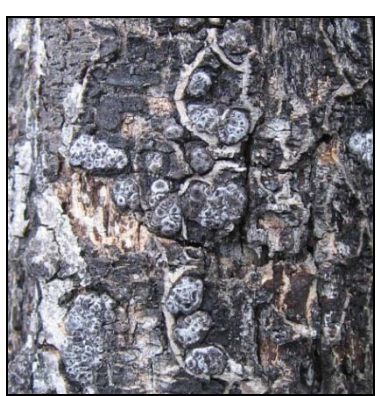
Figure 65: Hypoxylon canker perithecia