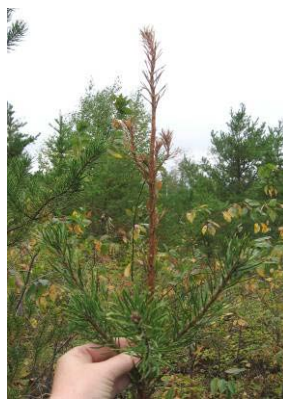
Figure 10: Late season terminal weevil Symptom on current leader