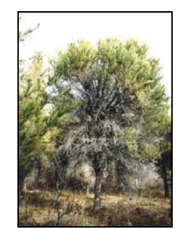
Figure 28: Deformed dwarf mistletoe infested pine