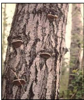
Figure 61: White trunk rot conks

White trunk rot of aspen is caused by the fungus Phellinus tremulae . It is the most important decaycausing fungus of aspen in the Prairie Provinces.