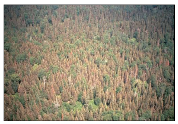
Figure 2: Severe spruce budworm defoliation – scorched appearance