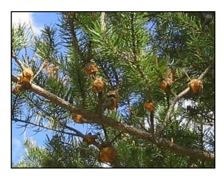
Figure 29: Galls on infected pine branches

Western gall rust cannot be eradicated, but managing the disease can reduce its impact. Sanitation (removal of live infected jack pine) at time of harvest is the most cost-effective method to protect the next generation. Small harvest blocks surrounded by infected jack pine stands can promote the rapid spread of the disease through the young plantation, if the distance involved is less than 300 metres. When harvesting in heavily infested stands, clear cutting of jack pine is recommended. Western gall rust remains on-site and re-infects new seedlings, causing mortality and growth loss if left untreated. Buffers, wildlife corridors, edge infections or unmerchantable residuals and other leave areas of heavily infected jack pine are not recommended if regenerating to jack pine.