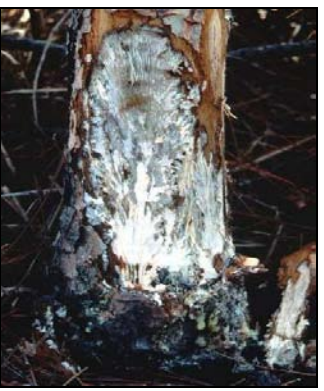
Figure 57: Root disease mycelial fan