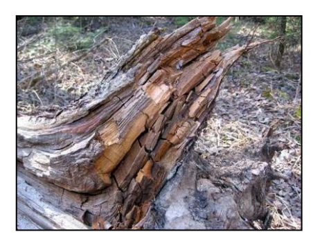
Figure 54: Brown cubical rot in roots