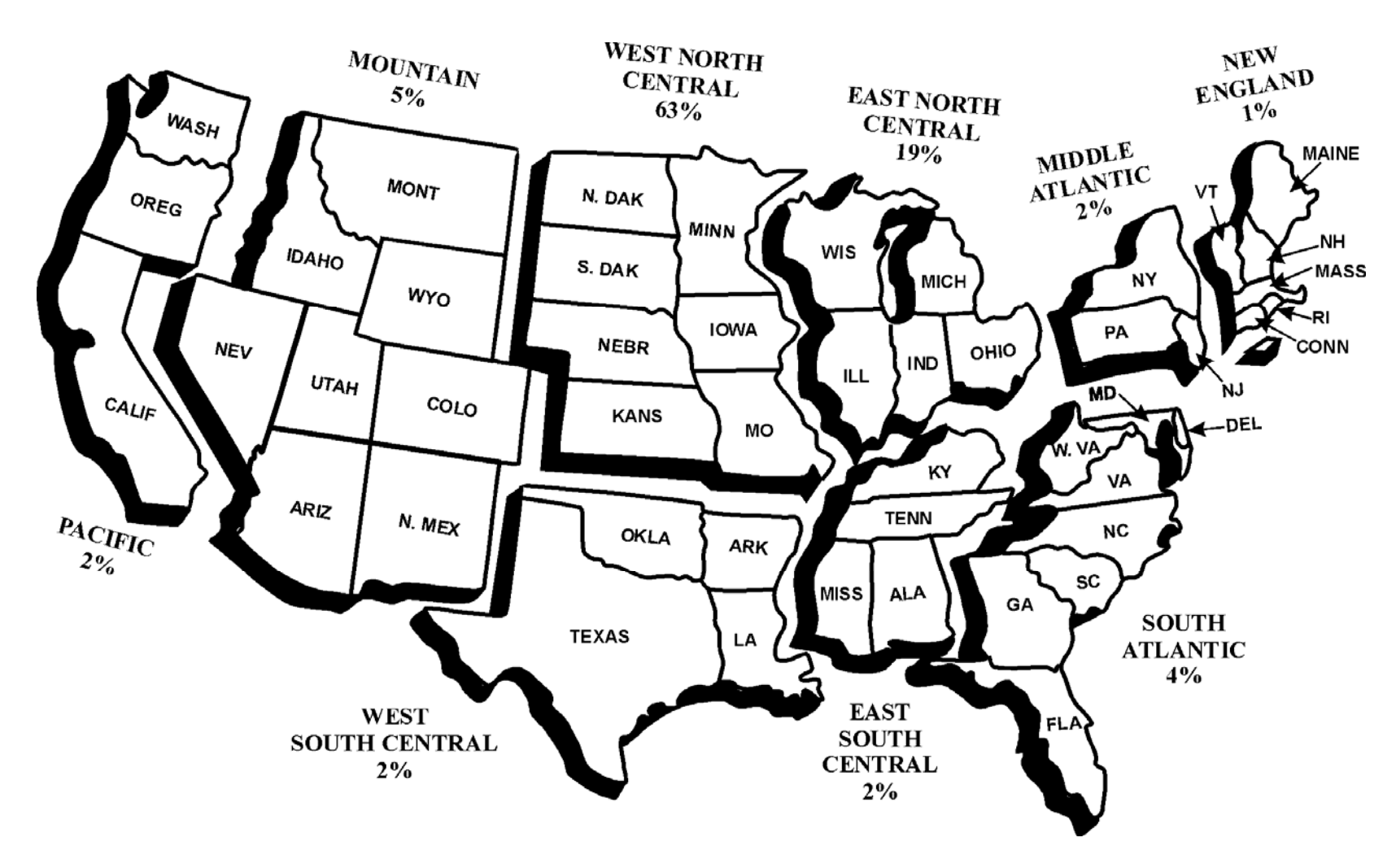
Figure 1: Regional distribution of United States residents who held Manitoba licenses in 2005.