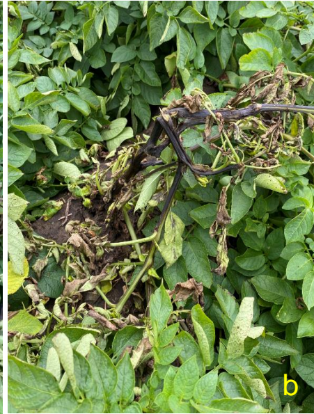
Fig.3. In fields with hail damage, and recent widespread rains have led to fair amounts of blackleg and bacterial stem rot incidence. Photo: Vikram Bisht, Manitoba Agriculture).