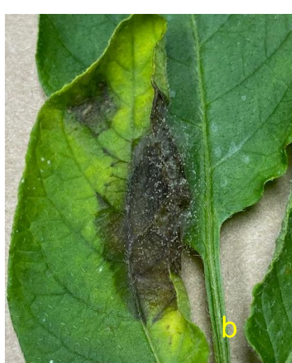
Fig.4 a: Late blight look-alike leaf spot on potato leaf.. b: A few days of incubation showed Botrytis sporulation..