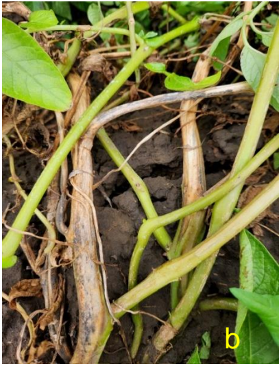
Fig.4 a, b. Early dying with black dot disease on stems is showing up in many fields.