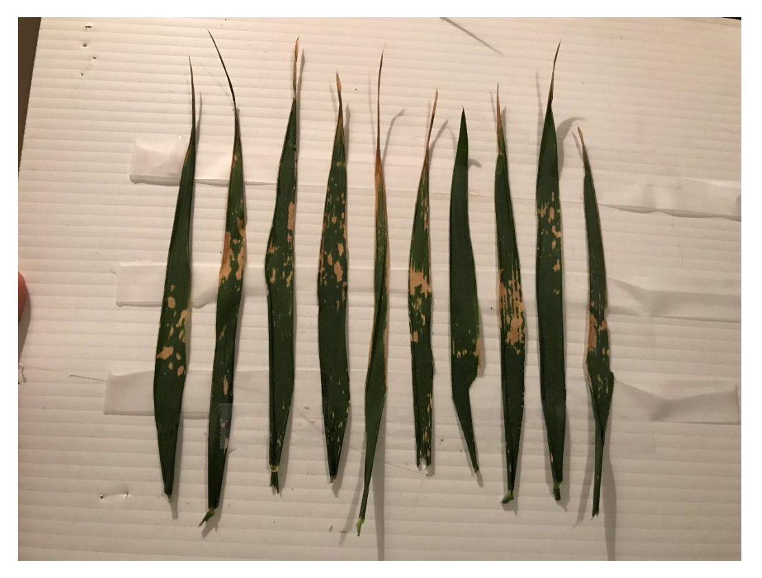
Figure 1. Leaf burn from 2018 PAN treatments. Average % leaf burn damage score = 9.5%.

As is typical, a range of leaf burn occurs. Below is an image of leaf burn from a field in the Homewood area. Average ratings of leaf damage are just under 10% and quite typical of past observations.