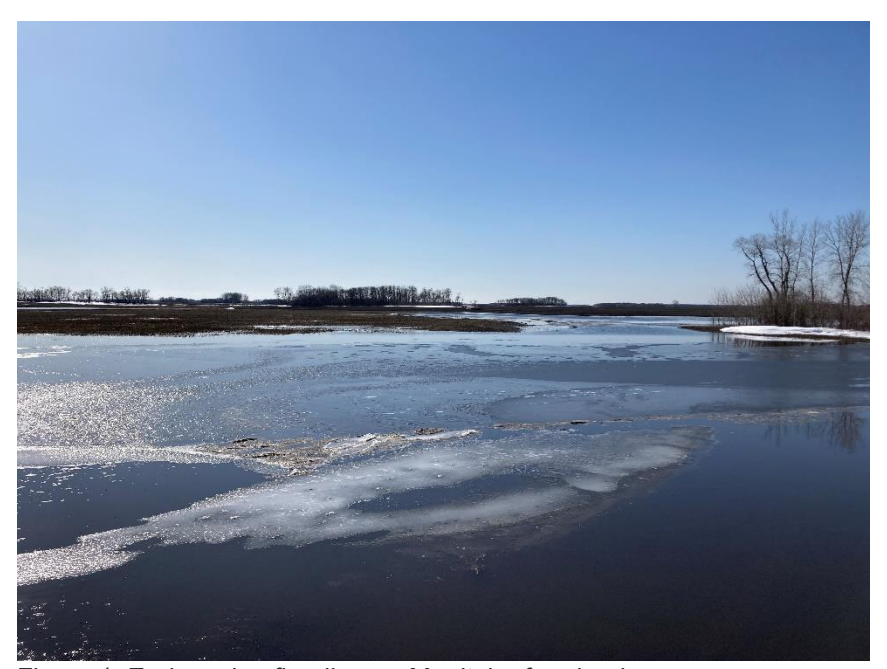
Figure 1. Early spring flooding on Manitoba farmland

Spring flooding may cause large losses of fall-applied nitrogen (N) fertilizer and residual nitrogen left over after the previous crop or fallow year (Figure 1). The following topics deal with losses of residual soil N, fall-applied N fertilizer, other nutrients, and how to determine the extent of N loss.