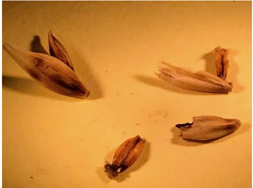
FHB and sooty mold on barley 1