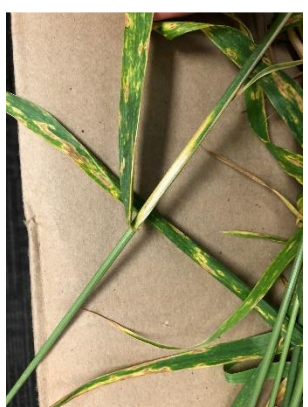
3 LSD on wheat - Rejean Picard