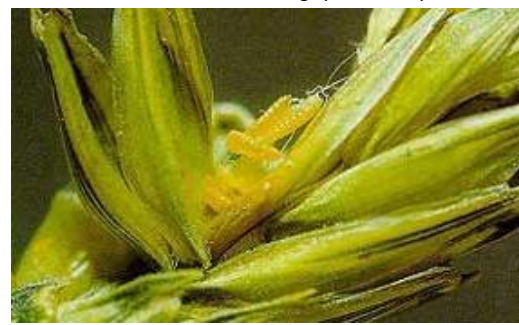
Figure 2. Wheat midge larvae feeding on developing wheat kernel.

In contrast, the midge is not active during the day. Wheat midge tends to flutter from plant to plant and assumes a vertical position with its head pointed skyward when resting on the plants.