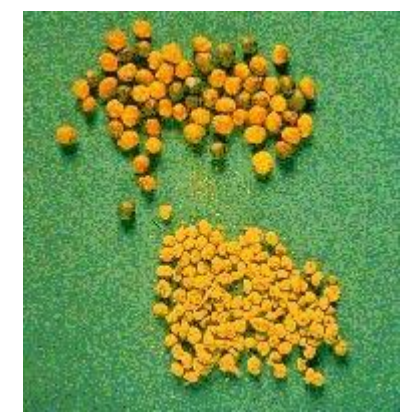
Figure 3. Canola seeds (top) and wheat midge cocoons (bottom).