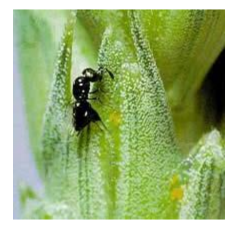
Figure 6. Macroglenes penetrans

Predators : Ground beetles (Carabidae) will feed on larvae of wheat midge when they are in the soil. Studies in Saskatchewan found 14 species of ground beetles feeding on wheat midge larvae, and estimated daily predation ranged from less than one to 86 wheat midge larvae per m<sup>2</sup>.