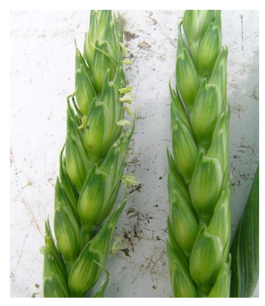
Figure 5. Wheat heads with anthers (left) and without (right).

Inspect the field in at least three or four locations. Midge densities and plant growth stages at the edge and centre of fields may be very different. The highest densities are often next to fields where wheat was grown in previous years or in low spots where soil moisture is favourable to midge development.