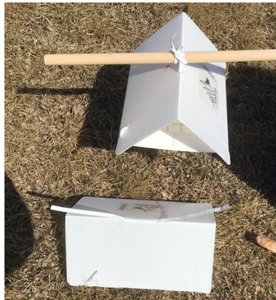
Figure 6. Delta trap secured in place using twist tie.

7. Depending on the supplier, the delta trap will either have a plastic twist tie at the top, or come with a bendable metal wire that can be secured into holes at the top of the trap. The twist tie or wire can be wrapped around a stake or one of the horizontal ends of a T-shaped bar to secure the trap in place.