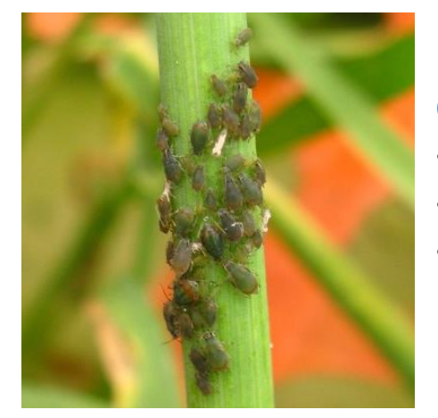
Figure 2. Oat-birdcherry aphid