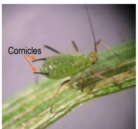
Figure 1. English grain aphid

In Manitoba, the English grain aphid ( Sitobion avenae ) and the oat-birdcherry aphid ( Rhopalosiphum padi ) can commonly be found on cereal grains, and the greenbug ( Schizaphis graminum ) occurs sporadically. The corn leaf aphid ( Rhopalosiphum maidis ) may at times be present on corn or small grain cereals. None of these aphids are known to overwinter in Manitoba; they move up from the South in late spring. Other less numerous species of aphids are also found on cereals in Manitoba. The term cereal aphid is sometimes used as a generic term to describe the complex of aphids commonly found on cereal crops.